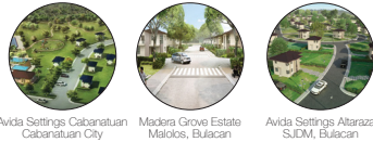
Avida Settings Cabanatuan City Madona Grove Estate Malolos, Bulacan Avida Settings Altanza SJDM, Bulacan

Architectural Intern Innovation + Design Group AvidaLand Corp. BGC, Taguig City