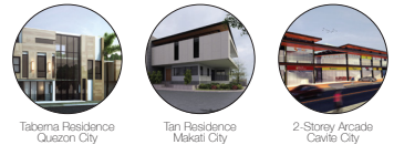
Taberna Residence Quezon City

Project Coordinator / Job Captain ACRM Architects West Avenue, Quezon City