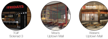
TGIF Solenad 3